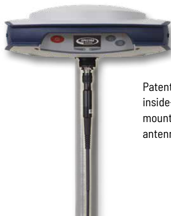
Patented inside-the-rod mounted UHF antenna design